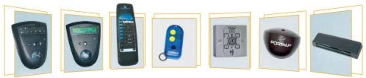
Pictograms display console LCD display console Multi-function remote control Infrared key 6-position key selector Hyper frequency detection Active infrared security